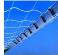
Plastic net clips 1