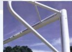
Net track system