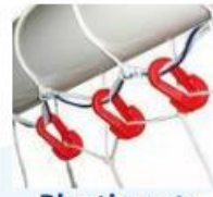
Plastic net clips 2