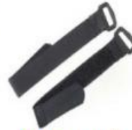
Velcro net straps