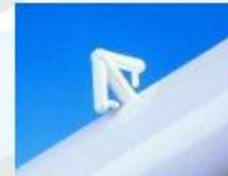
Synthetic Net Hook (UK)