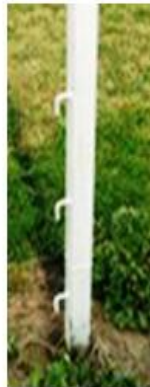
L Hooks on goal X